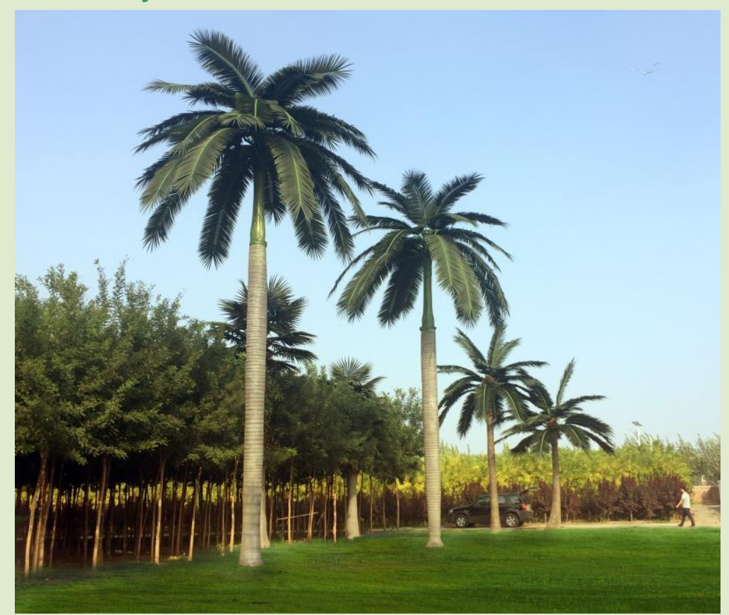
Artificial Royal Coco Palm : Anti-UV Artificial Leaves & Fiber Glass Trunk

(www.chinapalmtree.cn; en.zonglvshu.com)